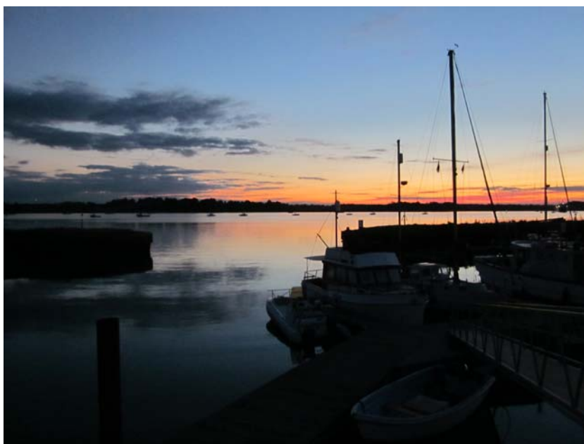
End of Season Sunset