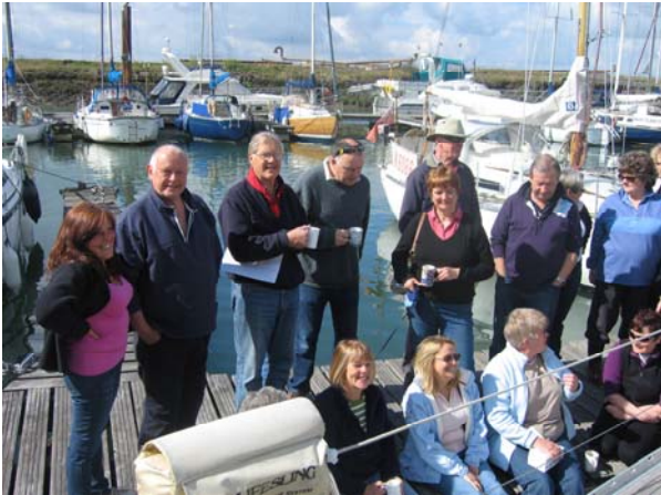
Rally briefing 2010